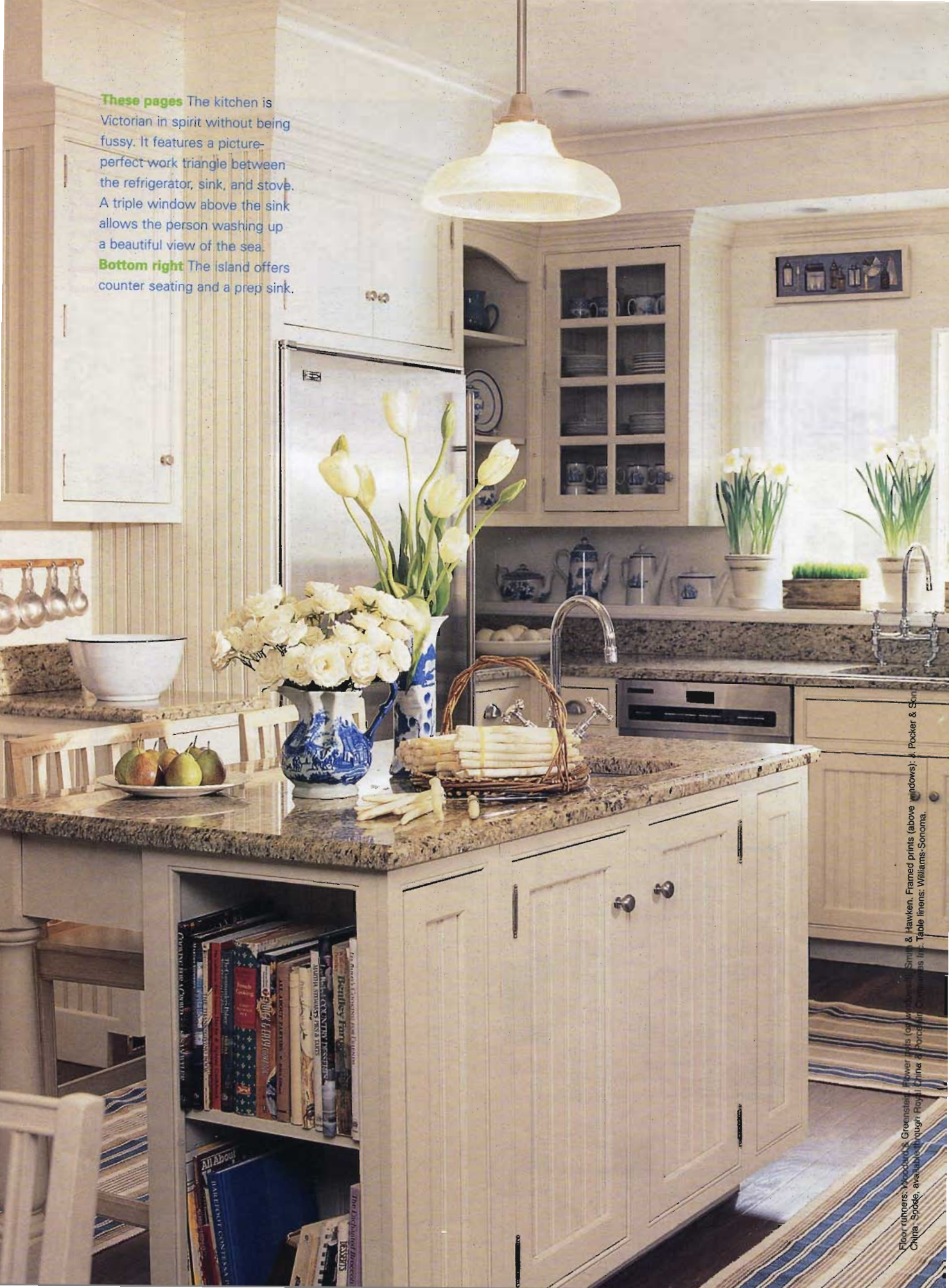
Floor runners: Woodstock Greenstead; Flower prints (above island): Smith & Hawken; Framed prints (above windows): P. Pocker & Son; China, Spode, available through: Royal China & Porcelain; Chandeliers: Williams-Sonoma.

Bottom right The island offers counter seating and a prep sink.