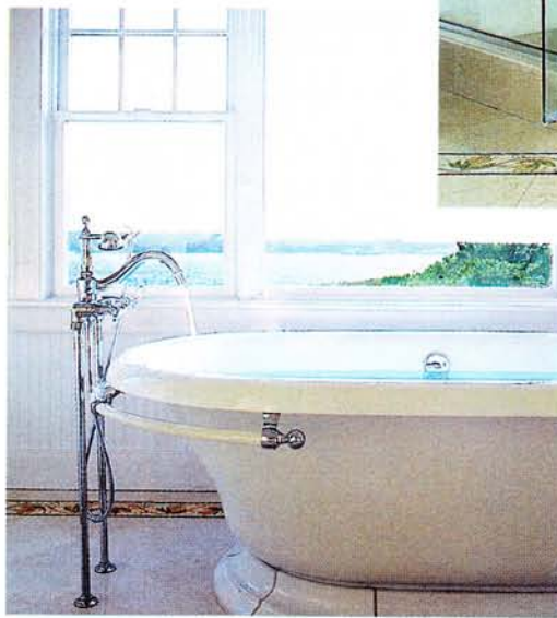
More bath design ideas: thisoldhouse.com/shortcuts