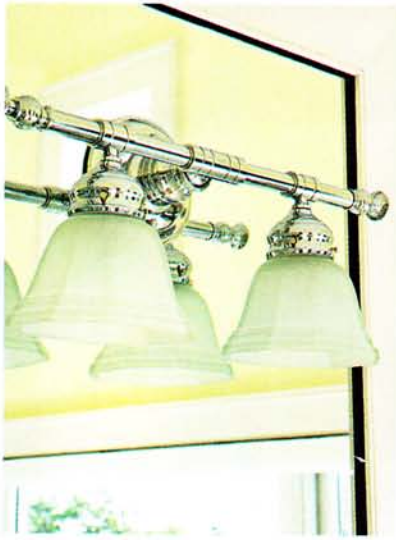
ABOVE LEFT: To have the sconces seamlessly installed on the mirror just took a little planning. The glass supplier predrilled a hole for each fixture to be fastened to a standard electrical box that had been installed in the wall.