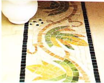
ABOVE MIDDLE: The mosaic border, made from tiny pieces of marble, came bonded to mesh backing for easy installation.